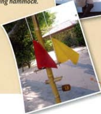
The flagpole system in PSV takes the place of phones and internet, and makes for a very interesting way to communicate.

approaches to address your needs, such as reiki, reflexology and deep-tissue massage. Best of all, you can receive your massage right in your room. Don't forget the open-air pavilion, where yoga classes can help tone your body and nurture your emotional health and general well-being.