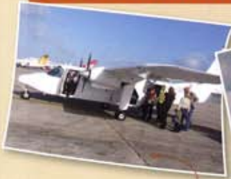
This was the plane from Barbados to Union Island, and yes – it is as small as it looks!