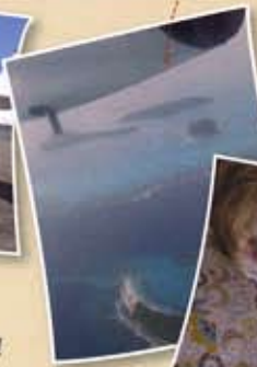
We took in an amazing view from the plane, just a few seats behind our skilled pilot.